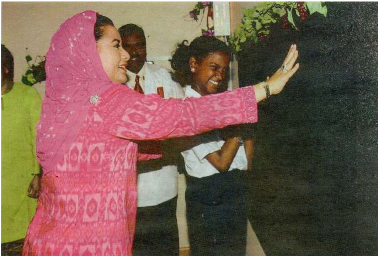
Loving touch: Raja Zarith Sofiah (left) taking a closer look at some of the learning tools with one of the special students at launch of the Ronald McDonald Sensory Room at the Johor Spastic Children's Association.