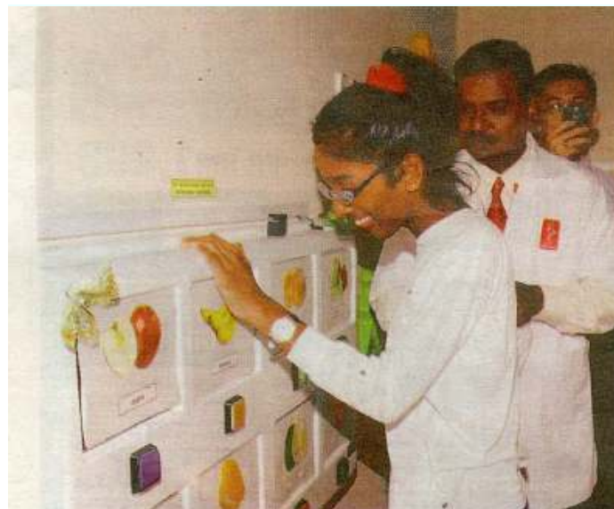
Great help: A special student taking a closer look at some of the learning tools.

It would be a good learning tool for teachers to educate these special students here, she said.